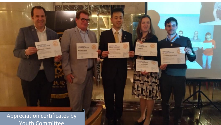
Appreciation certificates by Youth Committee