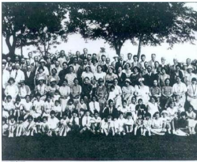
THE SHANGHAI ROTARY CLUB ON A PARTY

In 1935 Paul Harris paid an important visit to Shanghai where he planted one of his “Friendship Tree.” This was one of many visits Paul paid throughout the five continents between approximately 1932-1942 on a mission to spread good will among peoples and nations of the world. Upon several occasions, Boards of Rotary International have extended to us invitations to visit the Rotary clubs of other counties; such invitations we have, as a rule, accepted and we have tried to make ourselves ambassadors of good-will. With the cooperation of Rotarians and local governments, I have planted friendship trees in the parks and playgrounds on all the five continents of the world and even on some of the major islands of the seas. Our trees stood as symbols of international understanding and good-will. National and municipal governments have participated in the ceremonies incident to such plantings and monuments bearing bronze plates with appropriate inscriptions, have, in several instances, been erected. Our tree plantings are merely gestures of good-will but they are intelligible to all the citizens of the various countries whatever language they speak. About his period in Shanghai in 1935, Paul Harris writes in his memories that he was given the privilege of planting a tree in Shanghai and several officials of the city and many Rotarians were present.